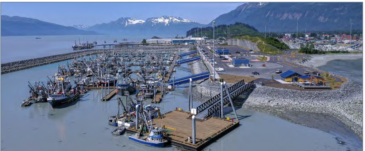
One week after the Grand Opening; seiners using the Drive-Down Float. Tenders moored at R-Float; Large Seiners at S and T floats; mixture of vessels beyond