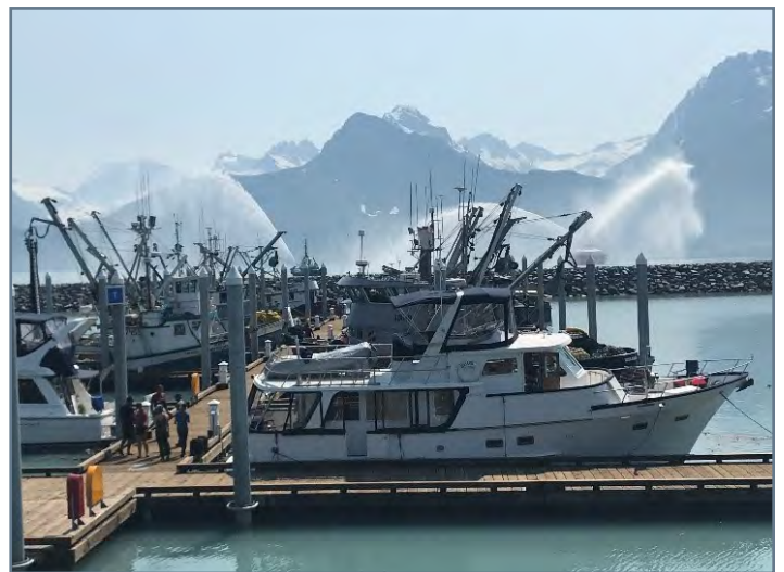
T-Float during Grand Opening; water cannons on SERVS tugs celebrate the event outside the harbor