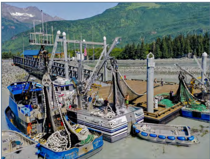
Seiners crews repair nets at the new Drive-Down Float.