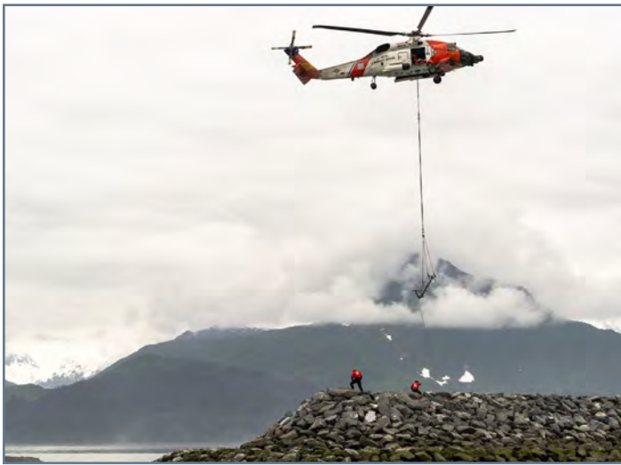
Coast Guard helicopter lowering a Navigation Aid to crew for installing at harbor entrance.