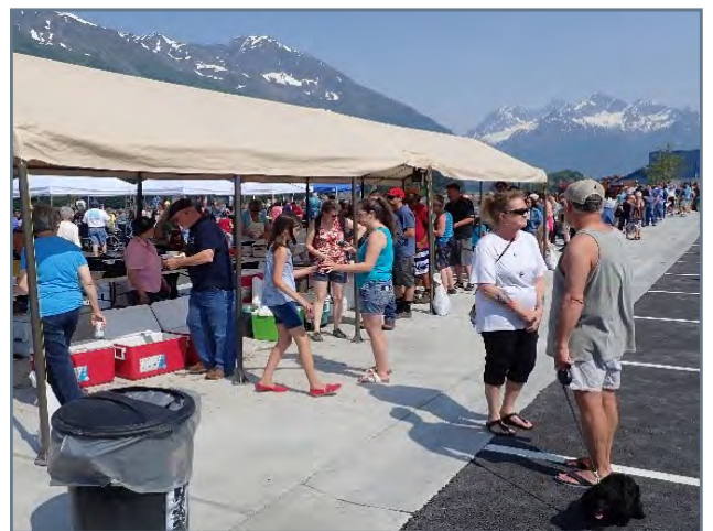
Lots of people, in food line above, enjoyed the beautiful day and the Grand Opening for the new harbor