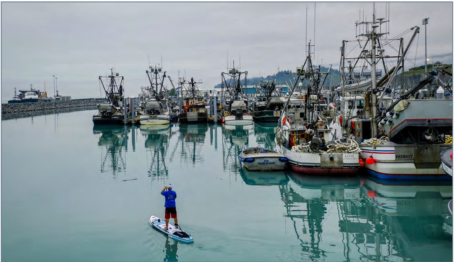
A one-person watercraft operator conscientiously practices "No Wake" speed near the big boats at R-Float.