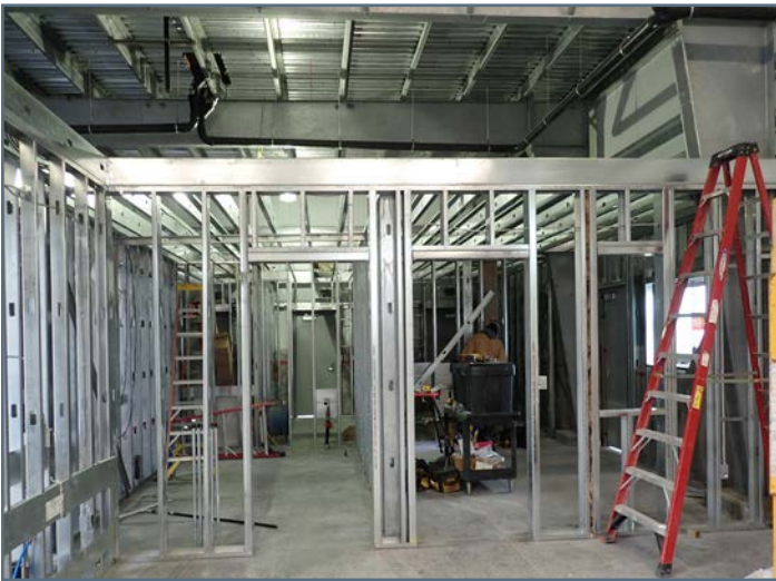
Steel framing for rooms inside Warehouse Building