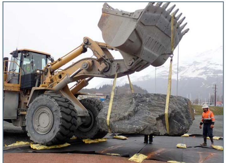
HS&G CAT 988 loader placing boulder for Airmen's Memorial Plaque