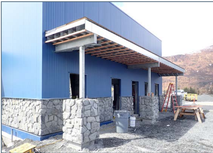
Canopy above entrance to the Warehouse Building restrooms and showers