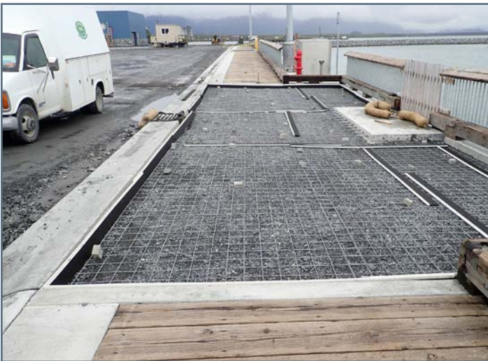
Installing reinforcement for concrete approach at pedestrian gangway