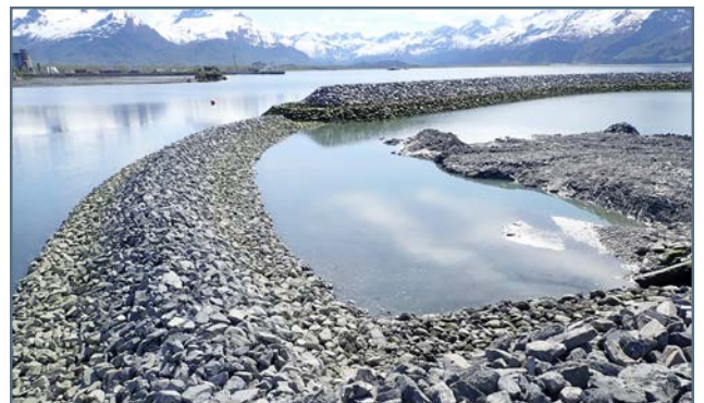
Rock was placed for construction of Sediment Containment Berm