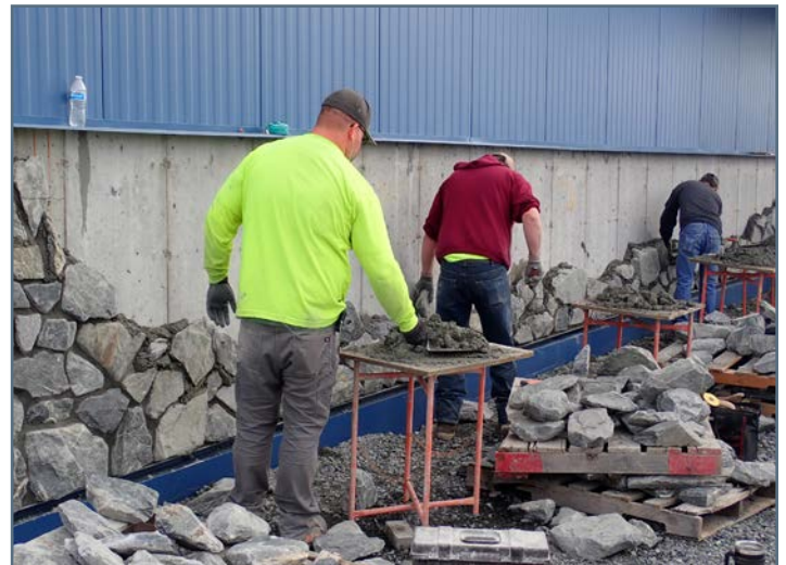
Mortaring native stone veneer on wainscot around Warehouse Building