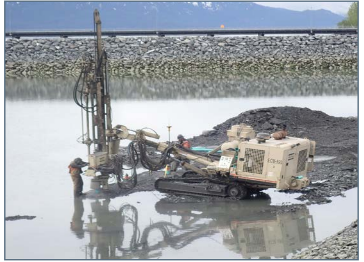
Drilling holes for explosives to blast bedrock in West Mooring basin