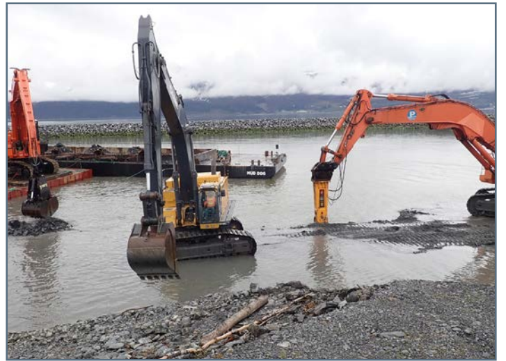
Rock broken by EX1200 (right) is excavated by Deere 870 (center) and staged for EX1200/clamshell on Flexi-Float to reach and place on dump barge