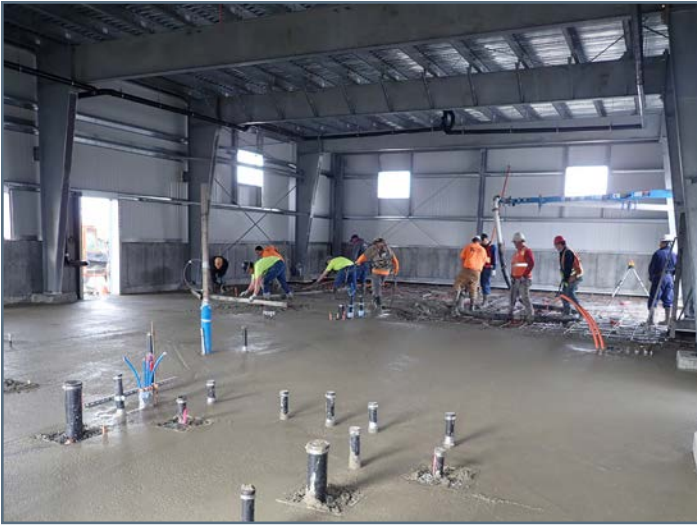
Leveling concrete pumped for Warehouse Building floor slab